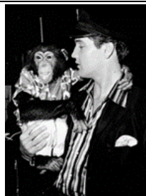
We know that Elvis took Scatter to his film rehearsals where he was very happy sitting in his master's chair!