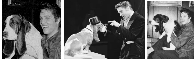
Steve Allen show.

'It was the most ridiculous appearance I ever did. I regret ever doing it'