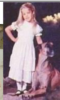
Lisa and Snoopy